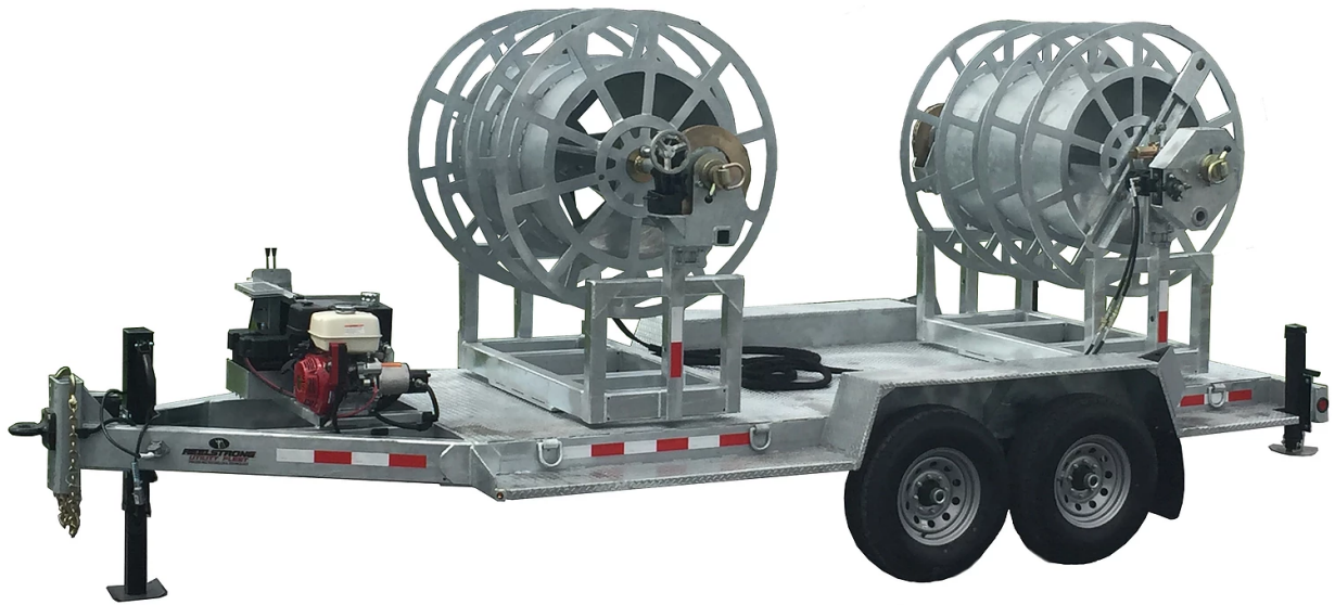
Shown w/ Wire Service Reel Option